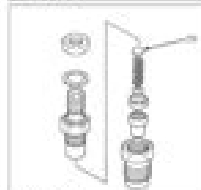
(1) Adjusting Member