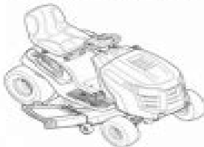
Hydrostatic Lawn Tractor — LTR 1045