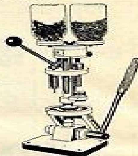
TABLE OF SHOT & POWDER BUSHINGS

Powder and shot charges are precisely-automatically-measured by means of these accurate bushings. Press comes with bushings for favorite load 121 grain Red Dot Powder, 1 1/4 ounces shot. See chart below for wide range of other precise bushings—use for every type of gun and type of shooting.