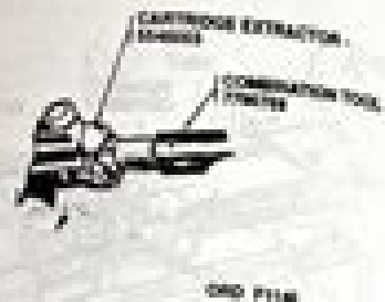
Figure 15. Removal and installation of cartridge extractor