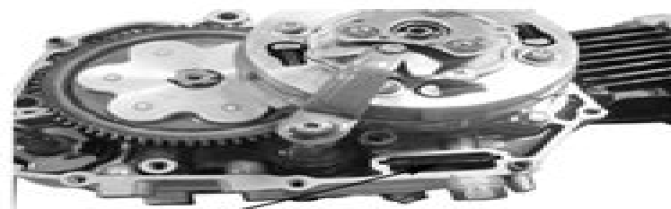
Oil Filter Screen Cap

Stop the engine and recheck the oil level.