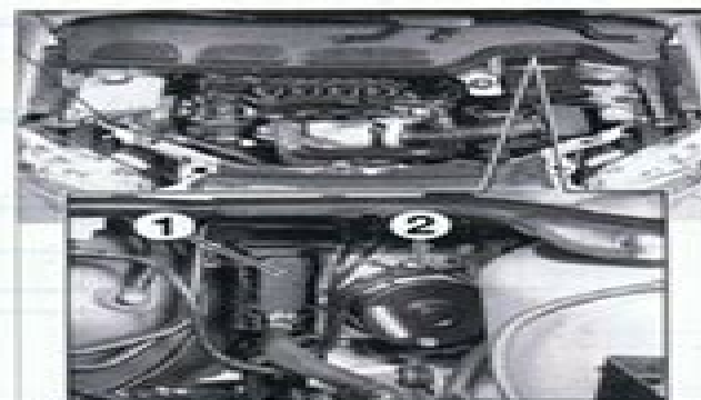
FIG. 7 Situación de los diferentes componentes del sistema ABS en el compartimento motor. - 1. Calculador ABS. - 2. Grupo hidráulico.

Colores: BK. Negro - BN. Marrón - BU. Azul - GN. Verde - GY. Gris - LG. Verde claro - NA. Natural - OG. Naranja - PK. Rosa - RD. Rojo - SR. Plata - VT. Violeta - WH. Blanco - YE. Amarillo.