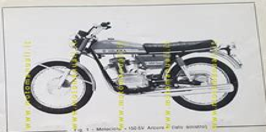
Fig. 1 - Motociclo - 150 SV Arzene (ciclo smontato)