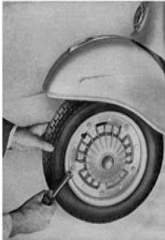
Fig. 13 - Removing wheel from vehicle