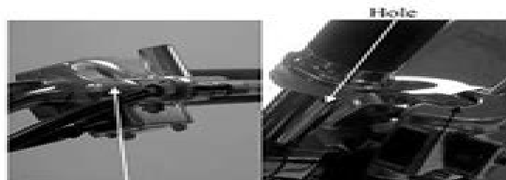
Clutch Lever Holder

When installing the right and left handlebar switch housings, align the pin on the housing with the hole in the handlebar. Tighten the two switch housing screws.