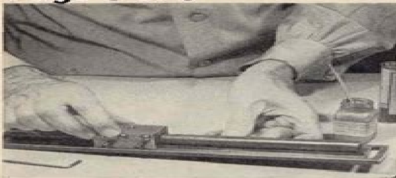
4. SLIDE BLOCKS should be lapped after reaming to assure smooth operation. Drill-rod track is coated with lapping compound. Block is stroked by hand

from a short length of heavy steel angle or can be made by welding two pieces of \frac{1}{2} -in. flat steel at a 90-degree angle. The bracket is screwed to the flat on the back face of the lathe carriage, Fig. 5. The dimensions on the angle bracket carrying the V-way clamp, Fig. 6, also should be checked with your lathe before cutting stock. The lower track, Figs. 5 and 8, should be parallel with the lathe ways.