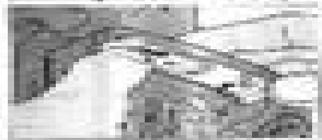
1. The SB-26 speedlight is mounted on the camera.