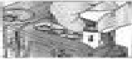
3. The SB-26 speedlight is mounted on the stand. The speedlight is attached to the stand's top plate via a mounting bracket. The stand is set up on a flat surface.