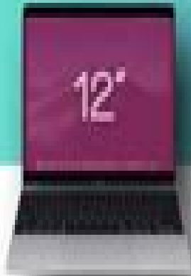
Apple MacBook 12