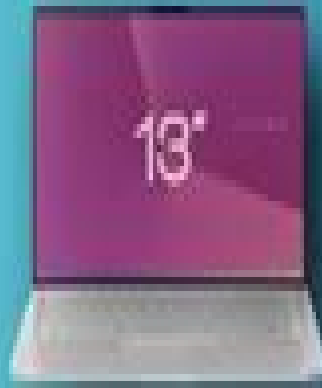
ASUS ZenBook 13