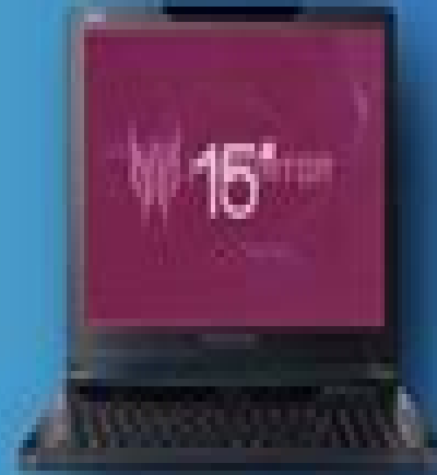
Acer Predator Triton 700