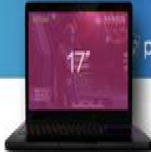
Razer Blade Pro