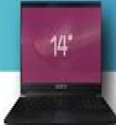
Gigabyte Aero 14Wv7-BK4