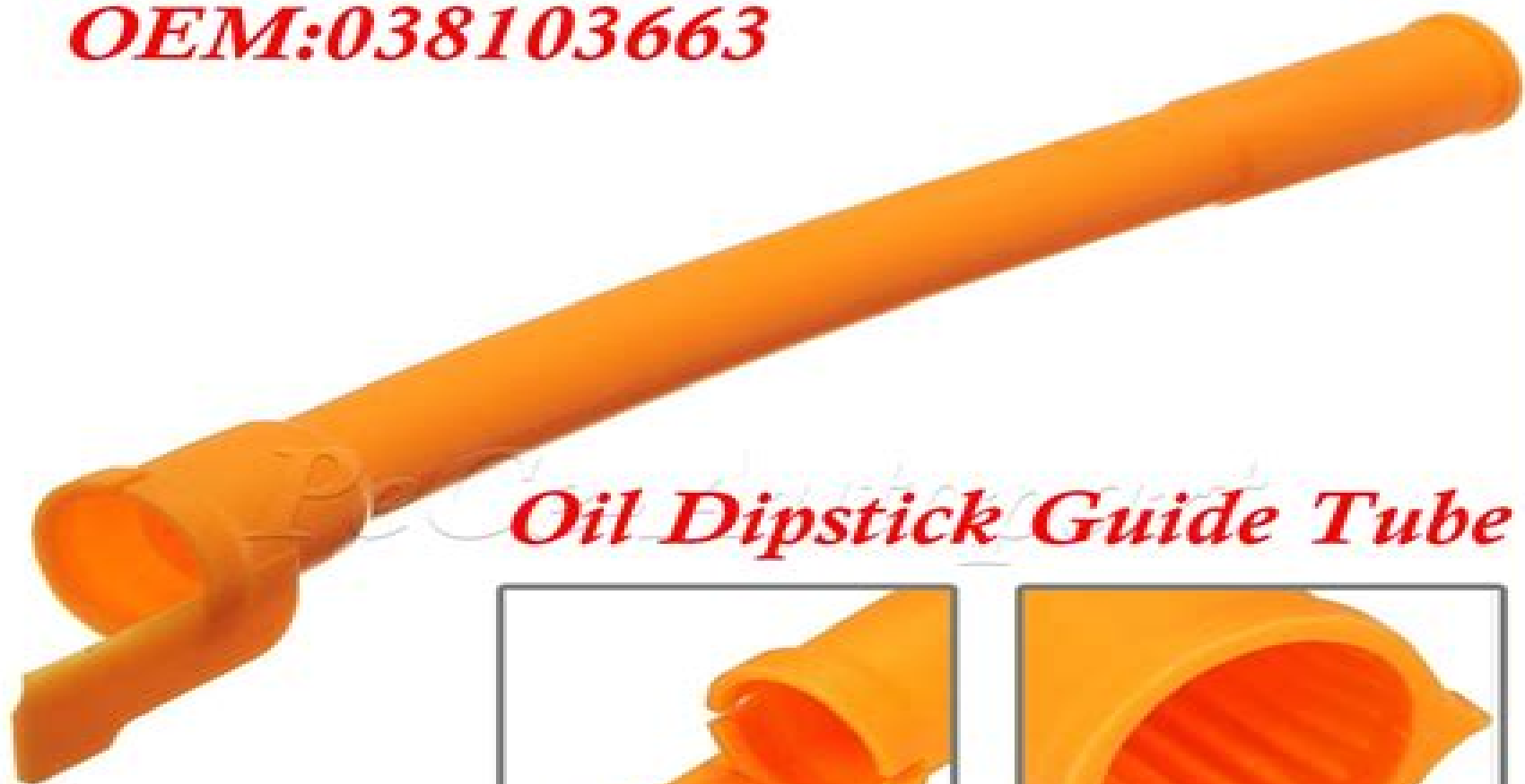
Oil Dipstick Guide Tube

For A3 A4 A6 1.9 TDi BORA GOLF Mk4 -Skoda OEM:038103663