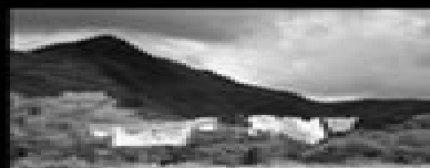
Wynedd Church, Shropshire