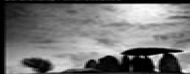
Pentre Fawr, Pembrokeshire