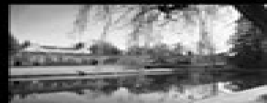
Aberystwyth House & Gardens