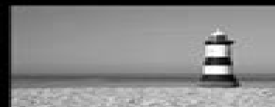
Peterson Point, Anglesey