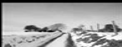
Pysgell Hill, Pembrokeshire