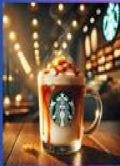
Starbucks' Caramel Macchiato