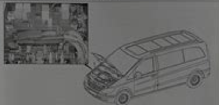
11. www.burton.com 12. www.burton.com