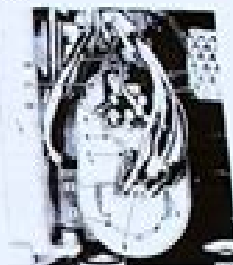
Most of customers used driving light units, engine room lighting, office etc.

Exterior light fixture (4.4 watts, 10-watt-equivalent) single contact type (range (No. 14) only—Trade No. 1414)