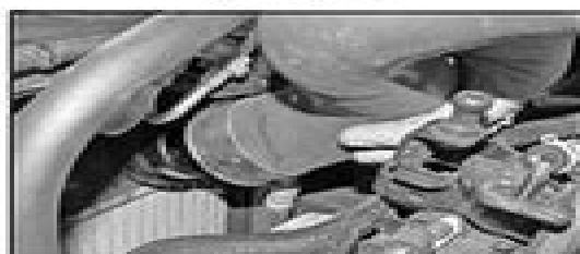
3.4b . . . and disconnect hose from intercooler