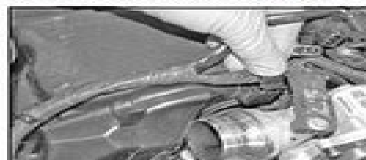
3.6 Disconnect the wiring connector and unclip wiring loom