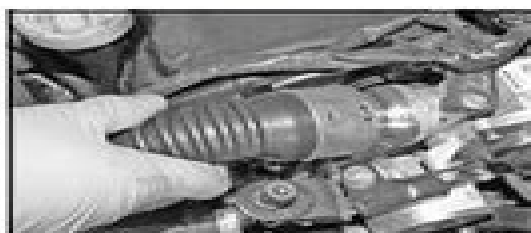
3.5 Disconnecting the intercooler rubber hose