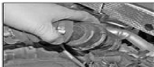
3.3b . . . and disconnect the intercooler rubber hose