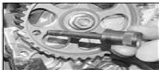
2.13a Fitting the camshaft TDC pin. . .