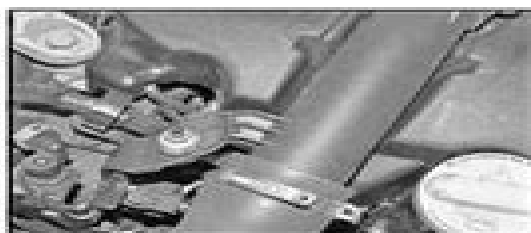
3.4a Undo the retaining nut. . .