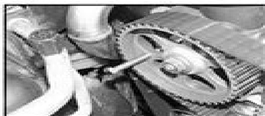
2.13b . . . or using a bolt to align the camshaft

engine whilst the crankshaft and camshaft timing pins are in position. If the engine is to be left in this state for a long period of time, it is a good idea to place suitable warning notices inside the vehicle, and