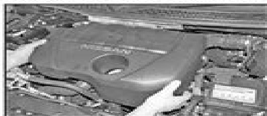
3.2 Unclip the upper trim cover

15 On completion, remove the timing pins and refit all removed components.