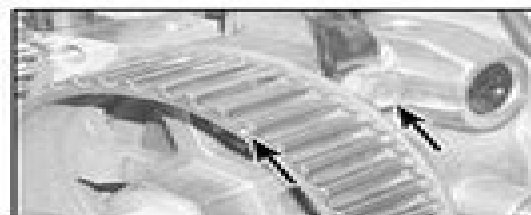
2.14 The mark on the high-pressure pump sprocket must be aligned with the bolt head on the cylinder head

14 Check that the mark on the high-pressure