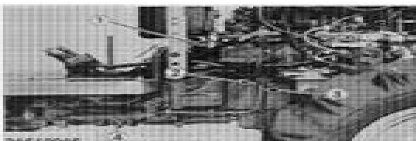
(1) Rubber Hose (2) GST Delivery Pipe (3) Delivery Pipe (4) Brake Rod