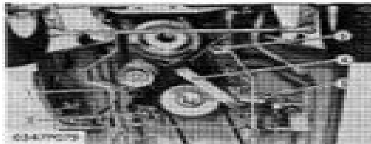
(10) Spring (40) Transmission Pulley (20) Speed Change Rod (50) Clutch Rod (30) Transmission Spring