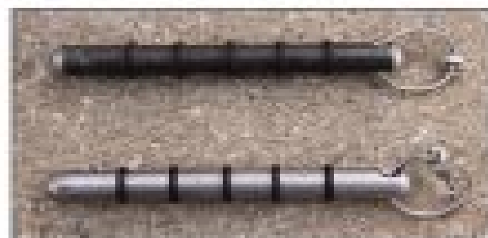
Personal Keyring Kubotan that looks innocuous.