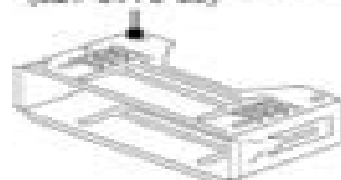
PLASTIC CABINET ASSY (A62-2736-03)