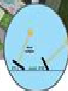
Best Energy-saving Angle