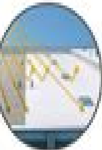
White Cool Roof