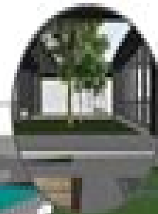
Adaptive Comfort & Natural Ventilation