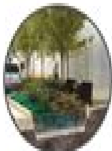
Low Impact Development