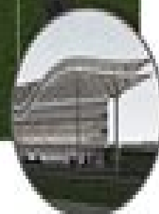
Double Roof Canopy