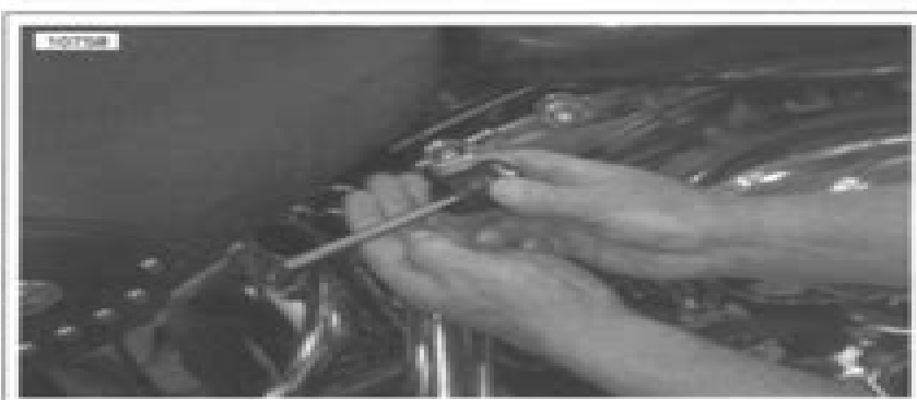
Figure 1-1. Checking Oil Tank Level