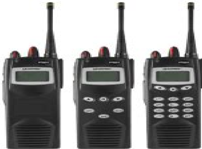
P7100 IP Series Portable Radios