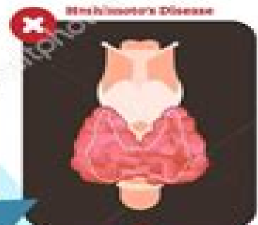
Enlarged and Inflamed Underactive Thyroid (Goiter)

Hashimoto's Disease, is an Autoimmune Disease in Which the Thyroid Gland is Gradually Destroyed