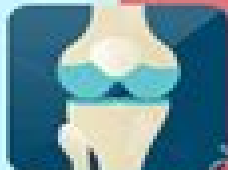
Joint Pain and Stiffness