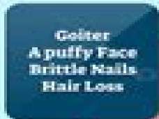
Goiter A puffy Face Brittle Nails Hair Loss