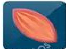
Muscle Aches, Weakness, Tenderness and Stiffness