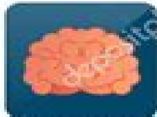
Memory Lapses Depression