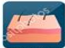
Pale, Dry Skin