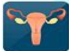
Excessive or Prolonged Menstrual Bleeding