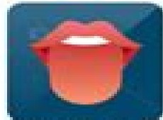
Enlargement of the Tongue