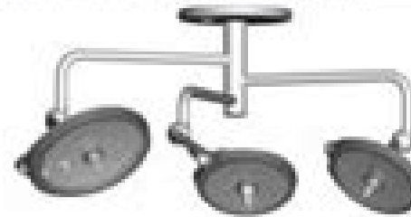
LED785/585/585 Triple Lighthead System