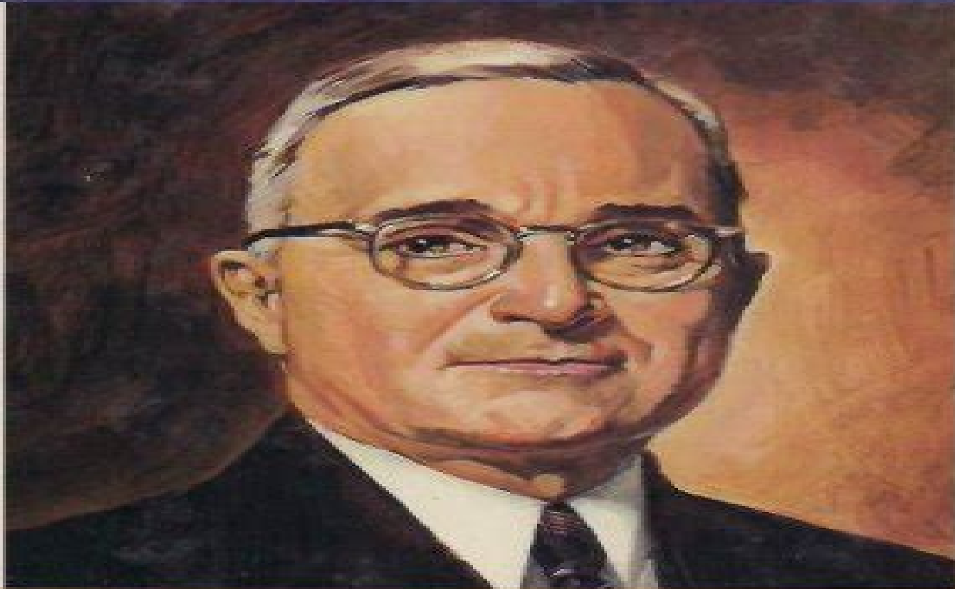
Harry S. Truman