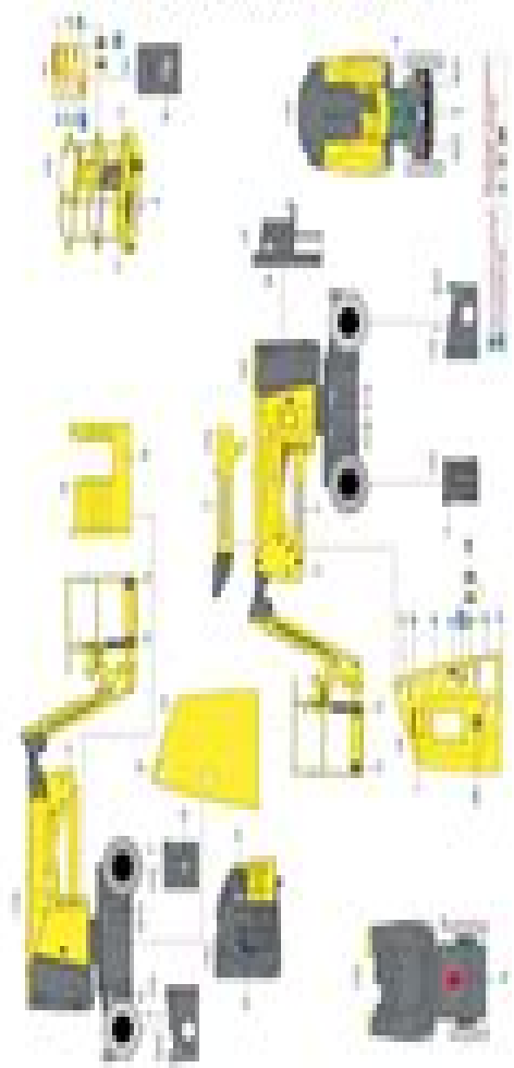
Lokalisierung der Aufsteller BRUNNEN - Seiten 15 und 16