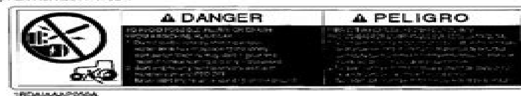
(3) Part No. EC3611-4748-1