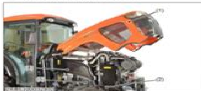
(1) Bonnet (2) Bonnet under cover (3) Side cover (4) Side bonnet