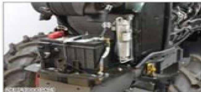
(5) Negative cable