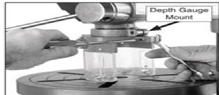
Figure 1. Example photo of installing chuck guard assembly.

Note: To prevent the guard from slipping off, move the table up to support it. Or, have an assistant hold the guard in place while you secure it.