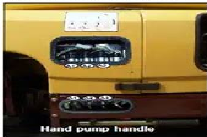
Fig. 4.4 - Breakdown control panel.

Depress the emergency stop switch on the lower control panel. Insert the hand pump handle in the hand pump (fig.4.5.). Activate the handle vertically while activating the manual control push button corresponding to the desired movement.