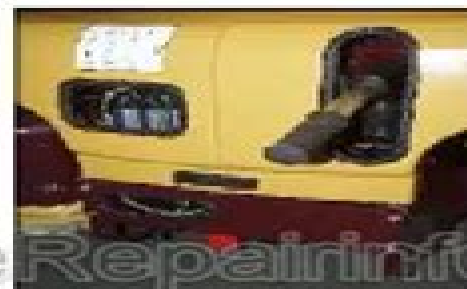
Fig.4.5 - Hand pump

The drive function is not available from the breakdown control panel.