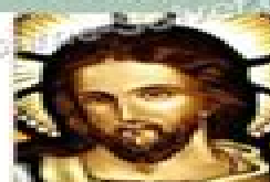
Jesus Christ Jesus Christ