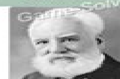
Alexander Graham Bell Alexander Graham Bell