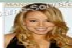
Mariah Carey Mariah Carey