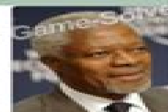
Kofi Annan Kofi Annan