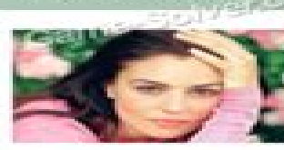
Monica Bellucci Monica Bellucci