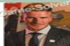
David Beckham David Beckham