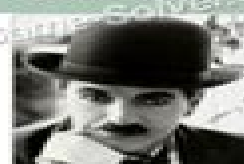
Charlie Chaplin Charlie Chaplin