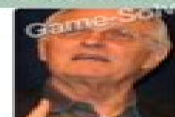
Alan Alda Alan Alda