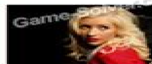
Christina Aguilera Christina Aguilera