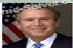
George W. Bush George W. Bush