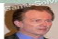
Tony Blair Tony Blair