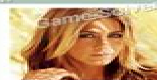
Jennifer Aniston Jennifer Aniston