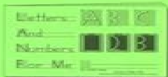
Letters and Numbers for All Kindergarten Workbook