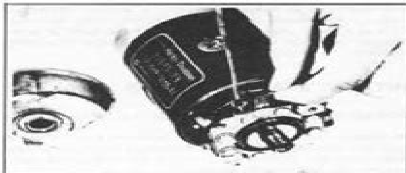
Figure 5-31. Removing Brushes — Hitachi Motor