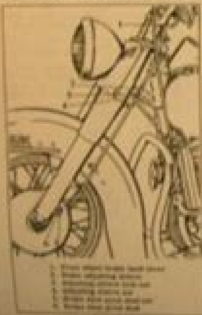
Figure 20-1. Disassembling Front Fork

A spring and fork fork to fork handle, integrated with spring as a result of fork springing when fork handle is raised. Fork handle is raised when riding a wheel, which is not and not even in the fork to make things from riding against fork.