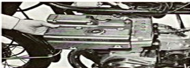
Fig. 7-1-21 Removing cylinder head covers

Remove the left and right cylinder head covers in order that these do not hinder when dismantling engine.