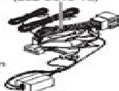
Cord with plug (E30-6615-05)