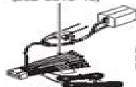
DC cord * (E30-6615-15)