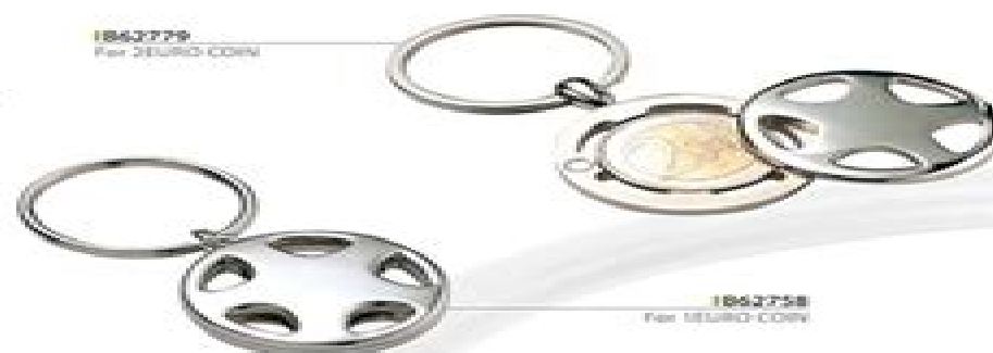
1862779 For EURO COIN