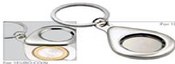
1862730 For EURO COIN