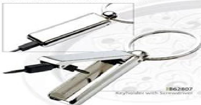
1862807 Keyholder with Screwdriver