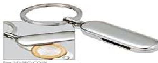
1862729 For EURO COIN