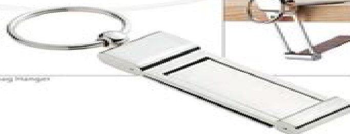
1862829 Keyholder with Handbag Hanger