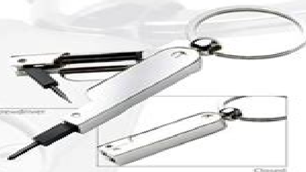
1862806 Keyholder with Screwdriver