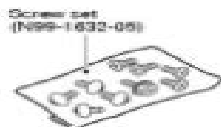
Screw set (N99-1632-05)