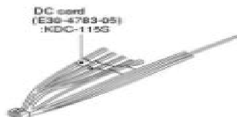
DC cord (E30-4783-05) :KDC-115S