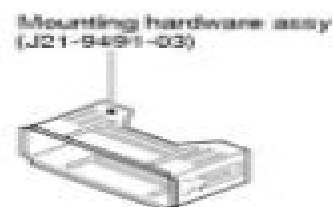
Mounting hardware Assy (J21-9491-03)