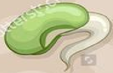
1 day old