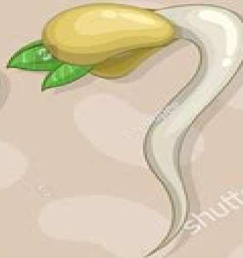
3 day old