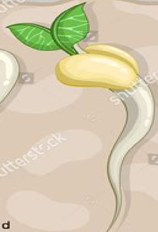
4 day old