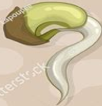
2 day old