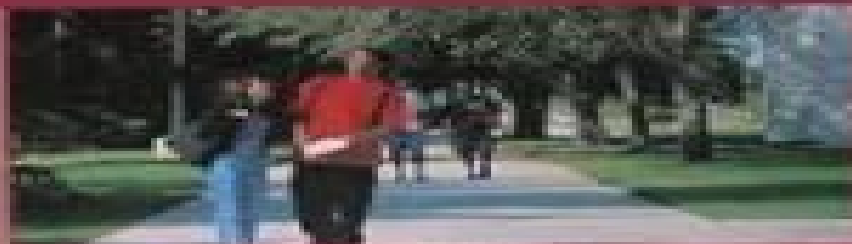
Palm Beach Gardens Campus

CUSTOM EDITION FOR PALM BEACH COMMUNITY COLLEGE