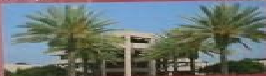
Boca Raton Campus