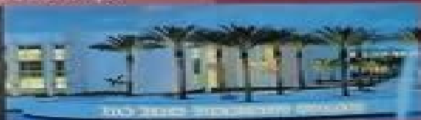
Lake Worth Campus