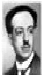
Louis de Broglie