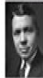
Harold Clayton Urey