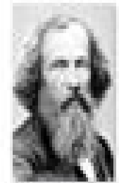
Dmitri Ivanovich Mendeleev