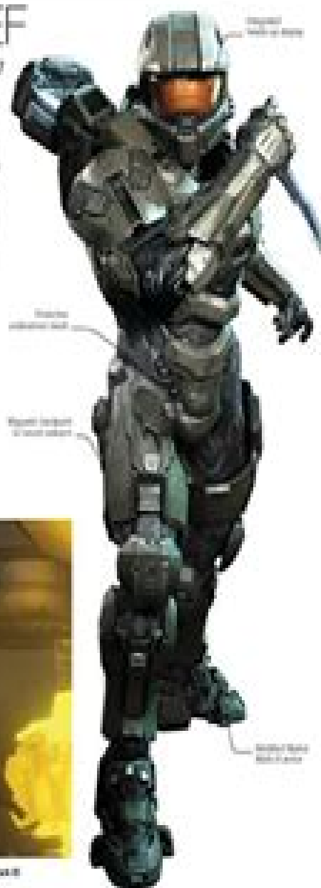
Master Chief's armor is a suit.