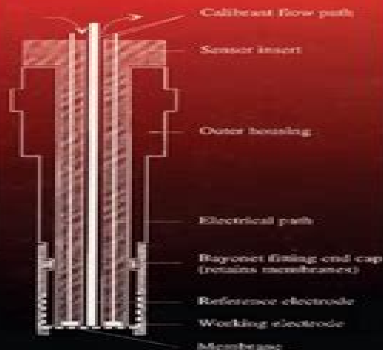
In-situ process biosensor