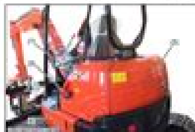
(a) Boom LH (b) Rear boom (c) Fuel cap