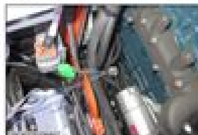
(a) Cabin suspension