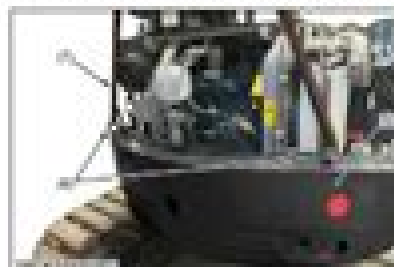
(a) Counterweight (b) Nylon sling