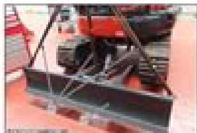
(a) Blade (b) Nylon sling 5. Remove the two pins from the blade, and blade assembly.