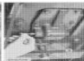
(3) Link Fulcrum Shaft Gear