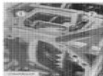
(1) Spring (2) Link 1