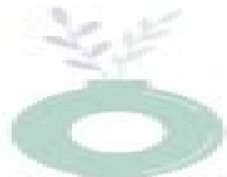
Hollow Circle Vase