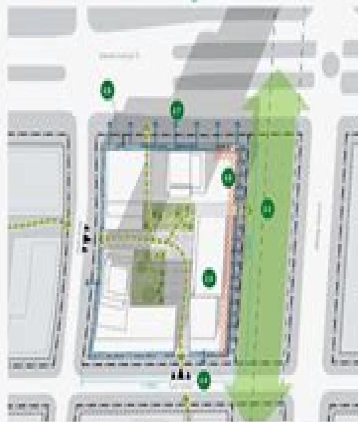
Figure 2 Illustration of framework principles to the block level